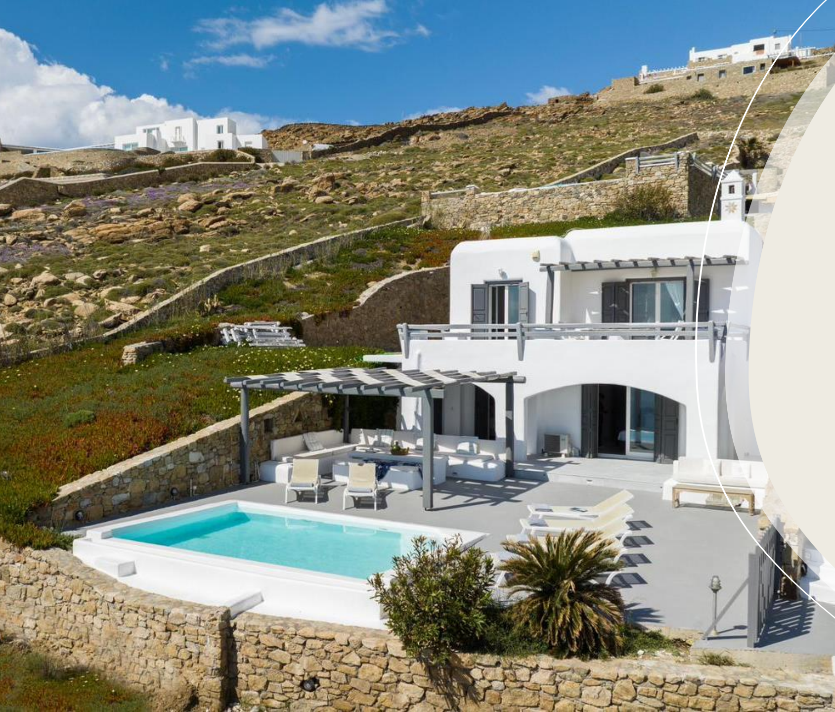
Traditional but Elegant Villa in Houlakia